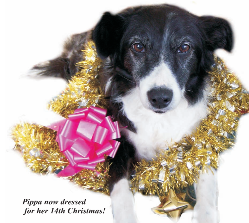
Pippa now dressed for her 14th Christmas!

If you have ticked the box you can sign a Gift Aid form. This will mean that your gift will be increased by 28p for every £1.00 you donate. The forms are available from our Treasurer.