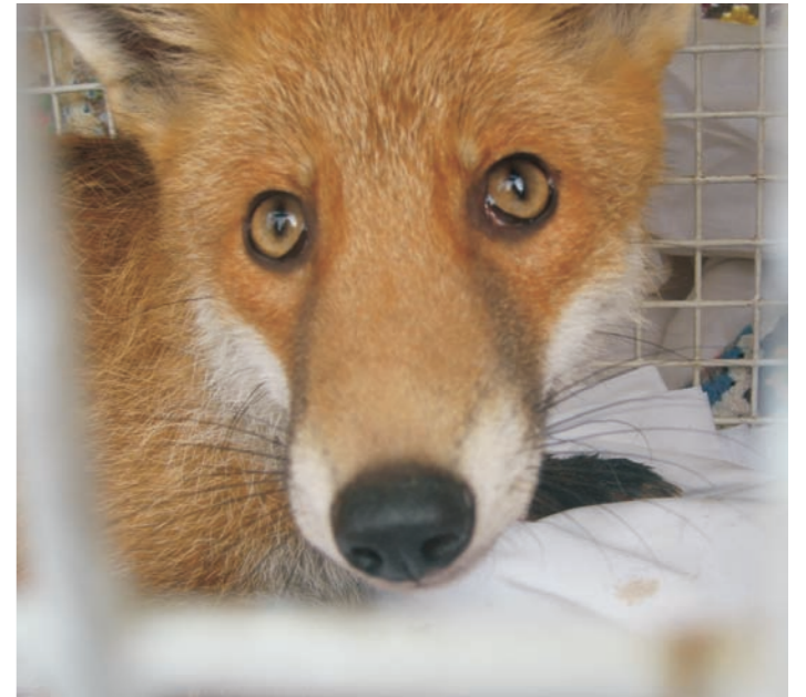
Bushy in perfect condition abandoned.

Another case of misguided kindness. Diana gets called to an over friendly fox!