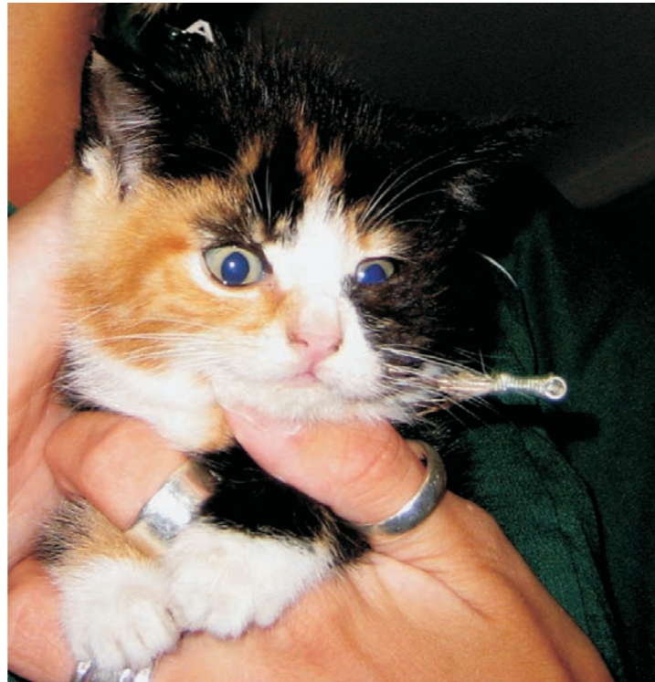
In the hands of the professionals. The hook clearly seen that nearly ended in disaster.

They have done this completely free of charge and have promised to maintain it indefinitely. This has generated a whole new audience for NDAA. The site has already received a huge number of hits and we have had very positive feed back. Future plans include online donations as well as up to date information and pictures.